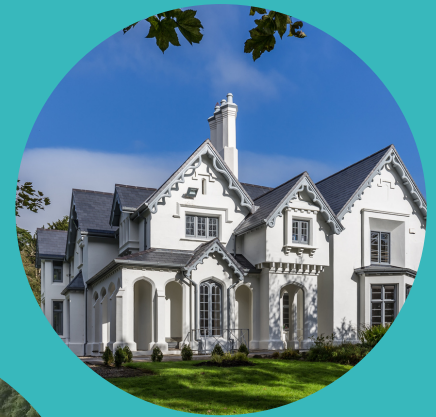
Villiers IB School

Parents and students interested in studying an alternative curriculum can choose to enrol in schools offering The International Baccalaureate (IB) Syllabus. Two schools in Ireland offer the IB Syllabus including Villiers IB Boarding School which is one of Ireland's most established schools with over 200 years of history, situated in the heart Limerick.